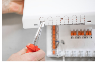
Break the cable entry out of the cover.