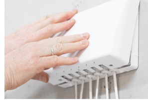
Snap on the cover.