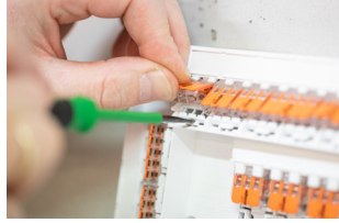
Release the connector from the holder.