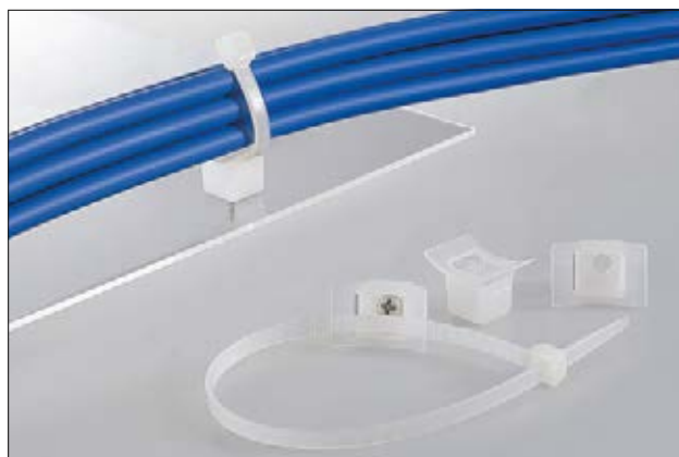
Cable Tie Mounts LKC Series.