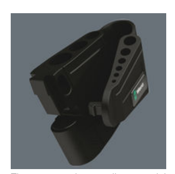
The wear-resistant clip material ensures that the L-keys are securely held yet are easy to remove.