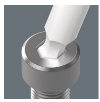
The spherical drive profile means that it is possible to swivel the axis of the tool to that of the screw, and therefore enable angled, "around-the-corner" screwdriving jobs.