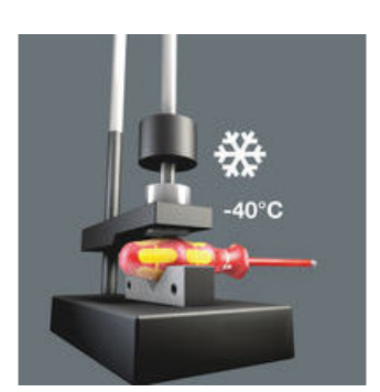
Impact strength tested at -40^{\circ} C, guaranteeing safety even under extreme conditions.