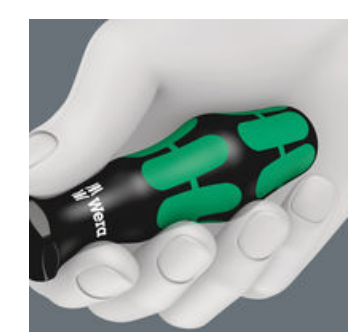
The outstanding design of the Kraftform handle that fits perfectly into the hand prevents hand injuries such as blisters and calluses.