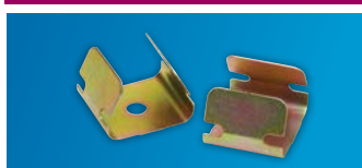
FIRE PERFORMANCE CLIP