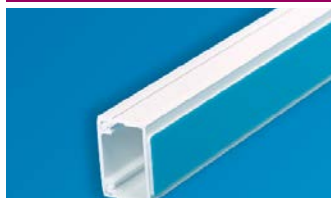
SELF ADHESIVE MINI TRUNKING White - Standardised in 3m lengths