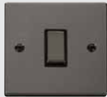
411 | 425