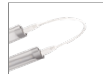
EN-CLA3 Interconnection Lead