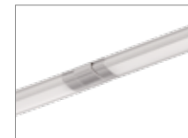
EN-CLA1 Connector Bar