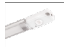
EN-CLPIR PIR Sensor