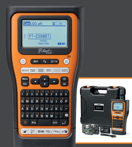
Handheld label printer with bluetooth and auto-cutter (up to 24mm)