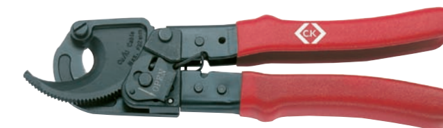
Cable cutter - Ratchet