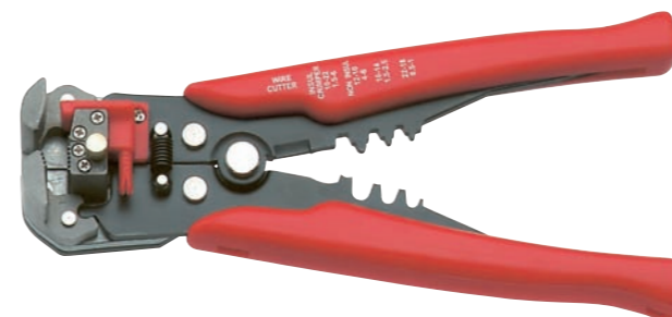
Automatic wire stripper