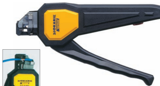
Jokari auto wire stripper - Side cutter