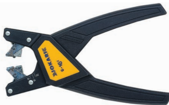
Jokari auto cable stripper - Round