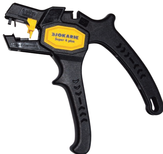
Jokari auto wire stripper - Single core