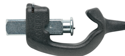
Cable stripper - Kabifix