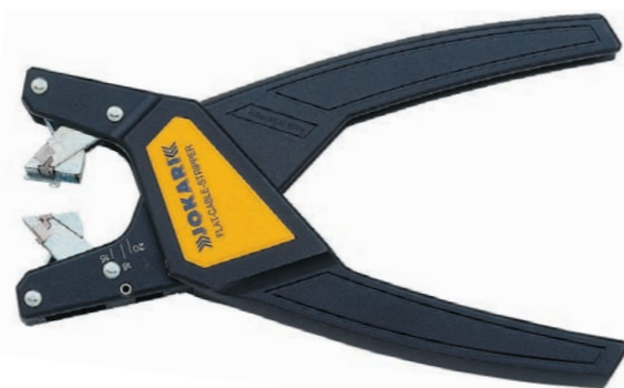
Jokari auto cable stripper - Flat