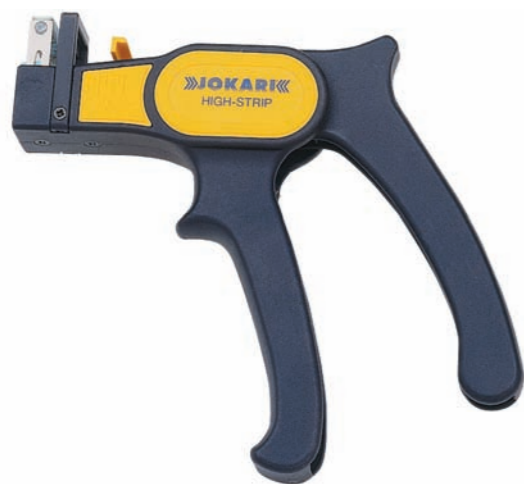
Jokari auto wire stripper - Tough insulation