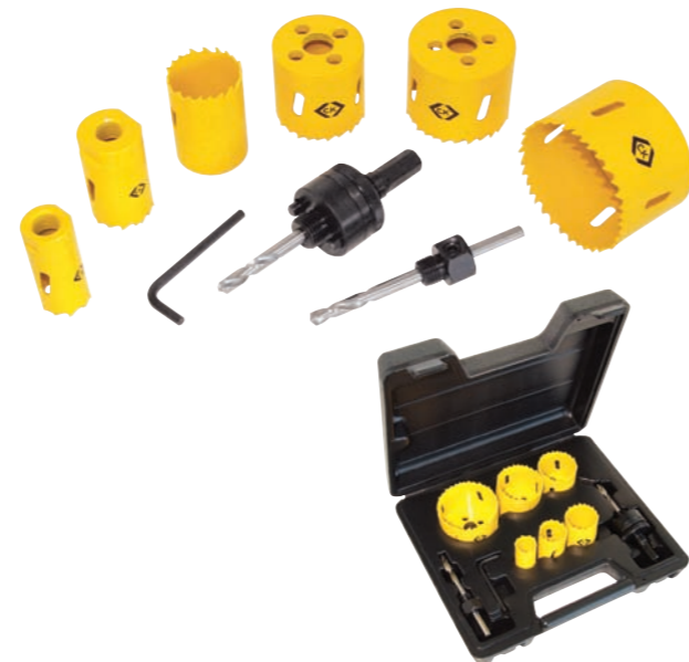
Holesaw kit - 9 Piece

CONTENTS: 1 x holesaw, sizes: 22, 29, 35, 44, 51 & 64mm. Arbor 14-30mm (8mm shaft). Locking arbor 32-114mm (11mm shaft). Hexagon key 4mm.