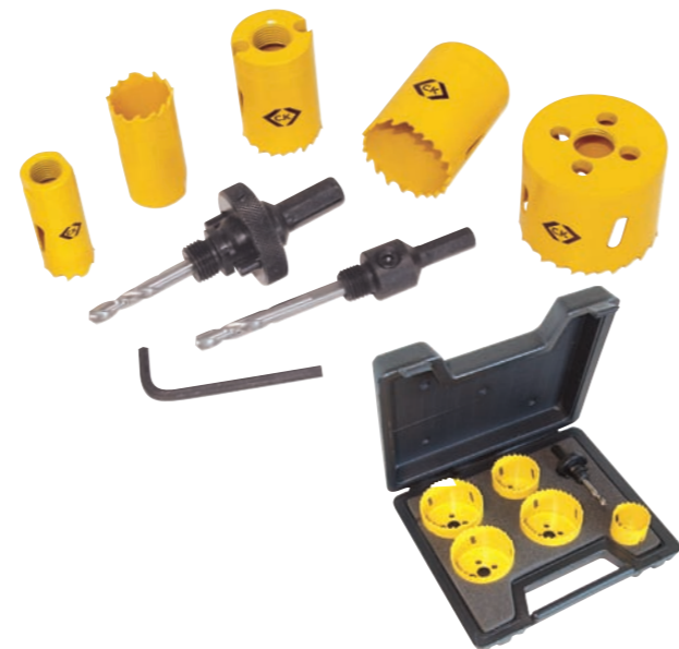
Holesaw kit - 6 Piece

CONTENTS: 1 x holesaw, sizes: 40, 54, 65, 67 & 68mm. Quick release arbor 32-114mm (11mm shaft).