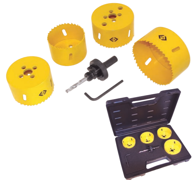
Holesaw kit - 6 Piece downlight

CONTENTS: 1 x holesaw, sizes: 65, 70, 76 & 83mm. Quick release arbor 32-114mm (11mm shaft). Hexagon key 4mm.