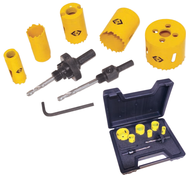
Holesaw kit - 9 Piece electrician

CONTENTS: 1 x holesaw, sizes: 16, 20, 25, 32, 38 & 51mm. Arbor 14-30mm (8mm shaft). Quick release arbor 32-114mm (11mm shaft). Hexagon key 4mm.