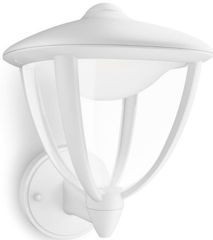
PHILIPS myGarden Wall light Robin white LED