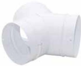
Ø100mm EasyPipe 100