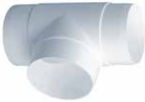
Ø100mm EasyPipe 100