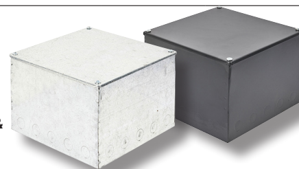
996GK & 996BK