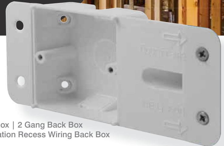
1 Gang Back Box | 2 Gang Back Box 6-in-1 Combination Recess Wiring Back Box