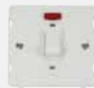
20A Double Pole Switch with Neon

Select either a Standard or Ingot Insert