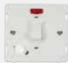
20A Double Pole Switch with Flex Outlet & Neon