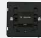
10A 3 Pole Fan Isolation Switch