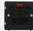
20A Sink & Bath Switch with Neon