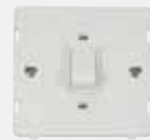
20A Double Pole Switch