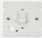
20A Double Pole Switch with Flex Outlet