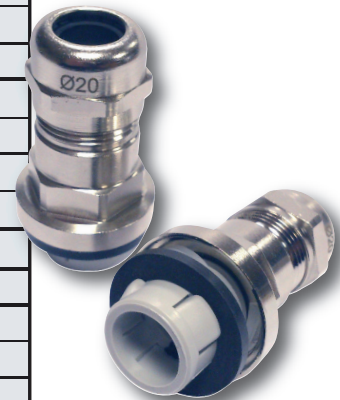
SmartFit Nickel-Plated Brass