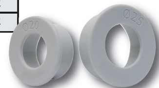
SmartFit Removal Tool

For a quick and informative example of how our SmartFit Gland works, scan the QR code to view the SmartFit Gland demonstration on YouTube or add the following code into your browser