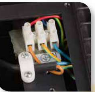
Simple and quick to fit terminal block connection

Instant illumination with substantial energy saving cost for use in a variety of outdoor locations. Ideal for enhancing the security and appearance of commercial buildings, gardens, driveways, outdoor parking areas etc. making them the right choice for environmentally responsible lighting. Ideal replacements for halogen, HID and other floodlights with the benefit of super brightness but at a fraction