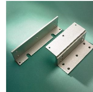
AEMBR089 Z&L Bracket to suit Inward Opening Doors