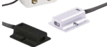
Duo version - twin heads