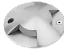
EN-RGLC3 G-Lite™ Stainless Steel Recessed Ground Light Bezel 3 way