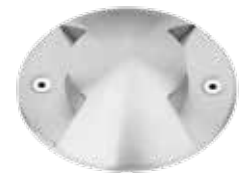
EN-RGLC2 G-Lite™ Stainless Steel Recessed Ground Light Bezel 2 way