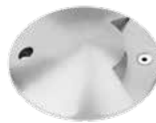
EN-RGLC1 G-Lite™ Stainless Steel Recessed Ground Light Bezel 1 way