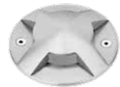
EN-RGLC4 G-Lite™ Stainless Steel Recessed Ground Light Bezel 4 way