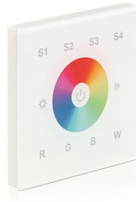
DMX RGB/RGBW Controller