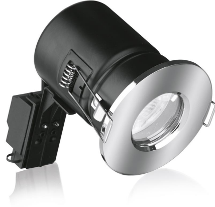
GU10 IP65 Aluminium Fire Rated Downlight