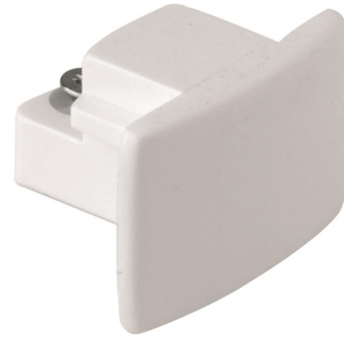
250V Global Dead End Connector Single Circuit Track