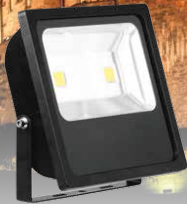
EN-FL100A 100W Adjustable IP65 LED Floodlight