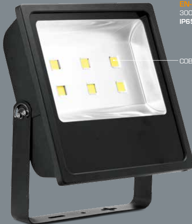
EN-FL300A 300W Adjustable IP65 LED Floodlight