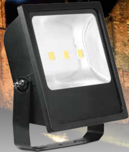
EN-FL200A 200W Adjustable IP65 LED Floodlight