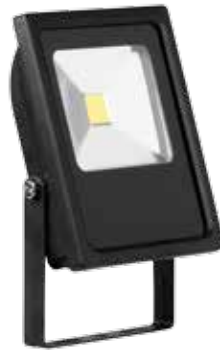
EN-FL30A 30W Adjustable IP65 LED Floodlight