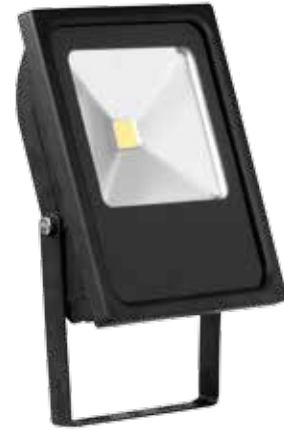
EN-FL50A 50W Adjustable IP65 LED Floodlight