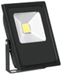
EN-FL10A 10W Adjustable IP65 LED Floodlight