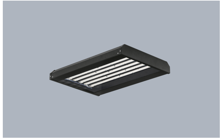
Hulk™ PRO 130W Linear Highbay