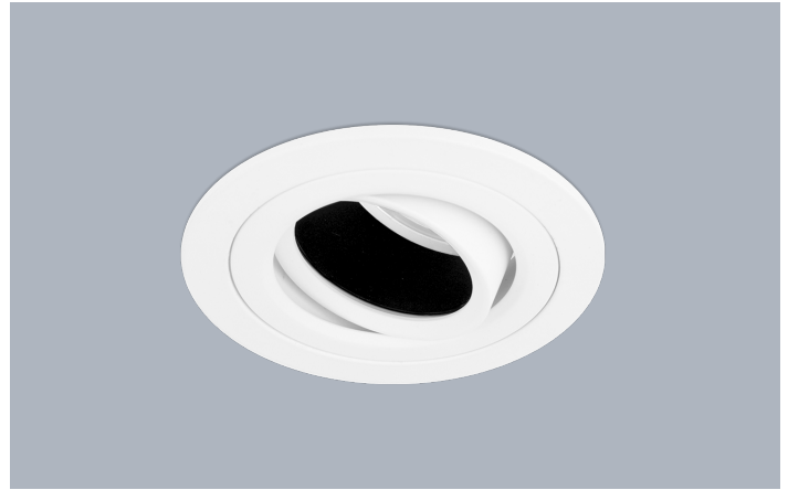
EDLM™ PRO Adjustable Black Baffled Downlight