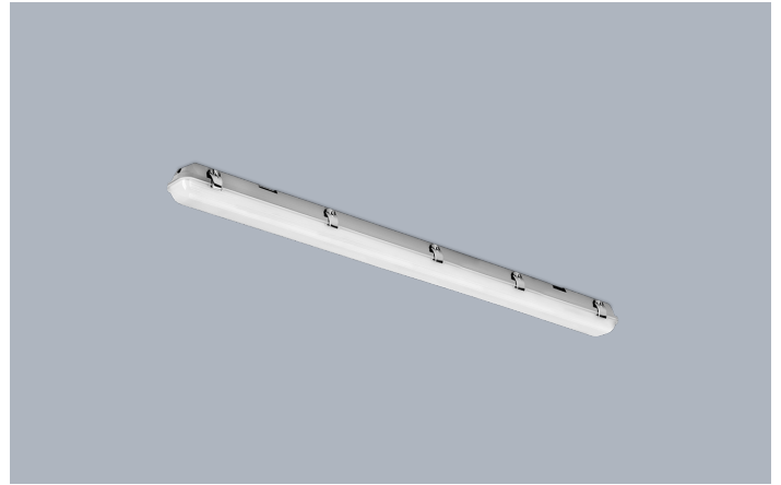
LinearPac™ 1200mm 17W IP65 LED Anti-Corrosive