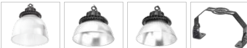
70° Polycarbonate 60° Aluminium 90° Aluminium Mounting Bracket