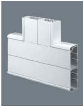
VTS2014WHI 50MM RADIUS BEND