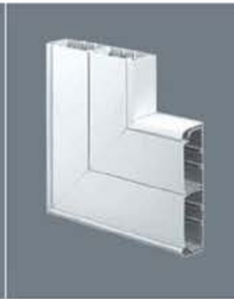
VTS2012WHI 50MM RADIUS BEND