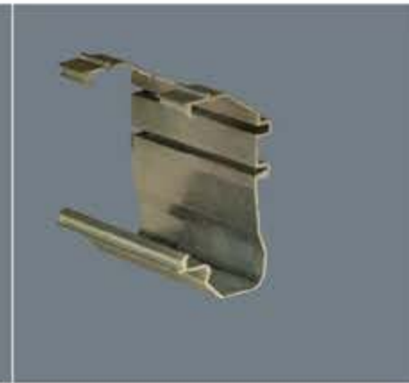
21017SST9 SPARE BONDING KIT