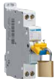
MZN175 (device & padlock not included)