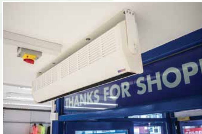
Overdoor heater providing a warm welcome for customers