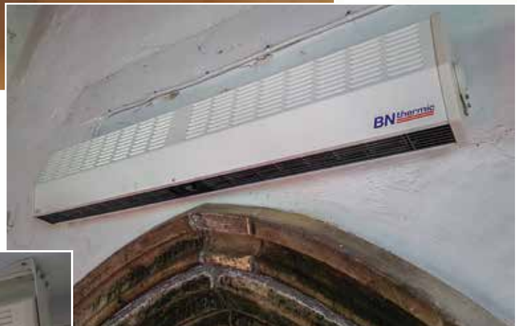
6kW heater combatting draughts in a church in Kent