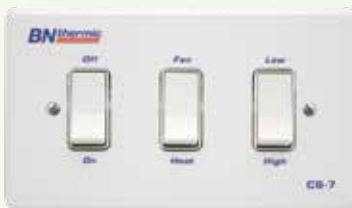
CS-7 switch for high/low/fan only settings