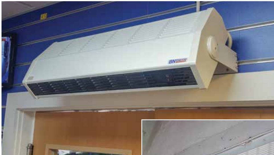
Overdoor heater installed to provide a 45° warm air stream