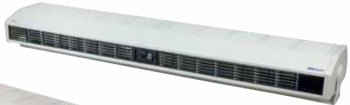
860T with wall bracket fitted