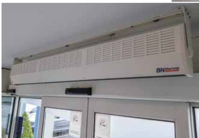
An 890 limiting heat loss in a hotel foyer in Lincoln

FOR MULTI-HEATER SYSTEMS WE RECOMMEND OUR SYSTEM X - See PAGE 24