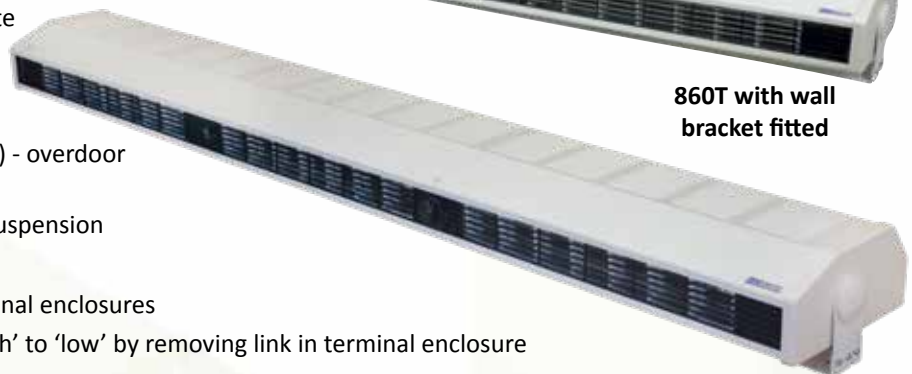
890 9kW Model