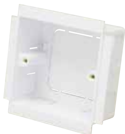
MTSB1, MTSB1-4, MTSB1-25, MTSB1-25-4, MTSB1-50