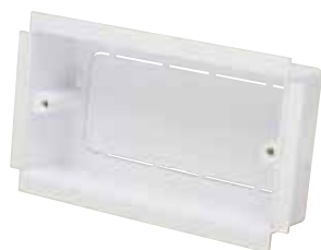
MTSB2, MTSB2-25 MTSB2-50