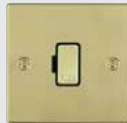
71 FO PB-B