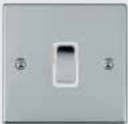
77 R21 BC-W