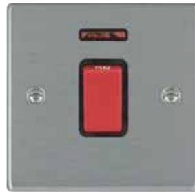
74 45N B