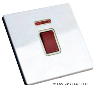
7WC 45N WH-W