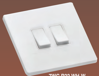
7WC R22 WH-W