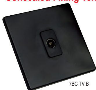
7BC TV B