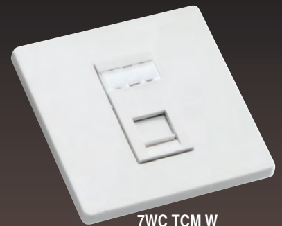
7WC TCM W