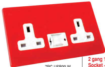
7RC USB99 W

2 gang 13A Unswitched Socket + 2 x USB Charging Points