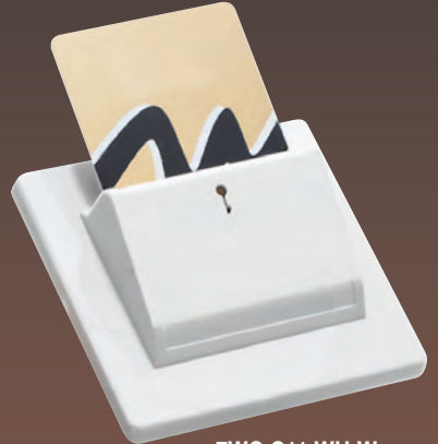
7WC C11 WH-W