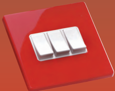
7RC R23 WH-W