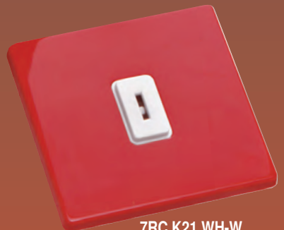
7RC K21 WH-W