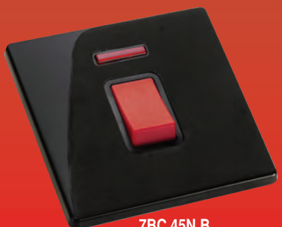
7BC 45N B