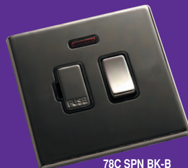
78C SPN BK-B