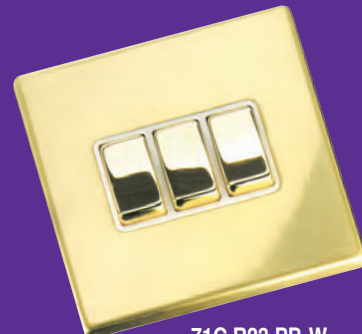
71C R23 PB-W