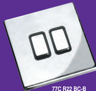
77C R22 BC-B