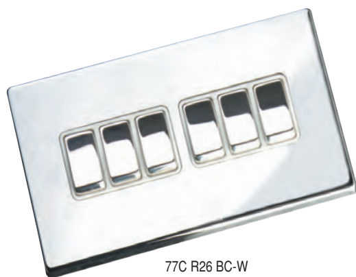
77C R26 BC-W