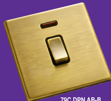
79C DPN AB-B