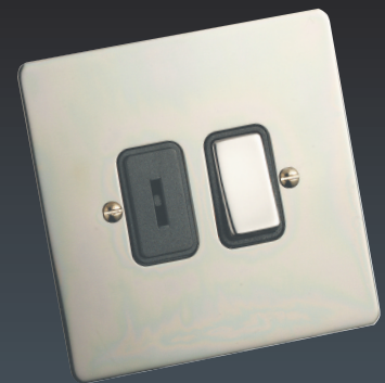
8P + I K21 B + I R21 SS-B