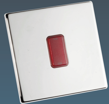
77C + I NO R