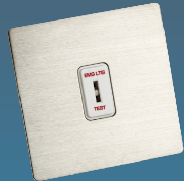
86C + I KEL W