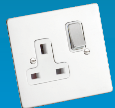
86 + I SS1 SC-W

Hamilton® fashion, finish, function and flexibility