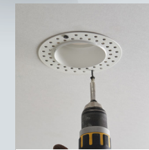
Trimless bezel on page 33