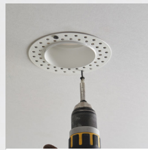
Trimless bezel on page 33