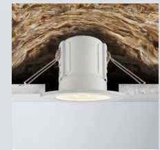
Can be covered with insulation