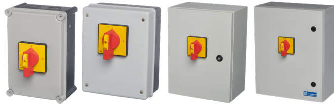
Insulated Metal Clad Steel GRPC