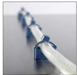
Detectable fixing solution containing of MCKR Mount and MCTS cable tie.