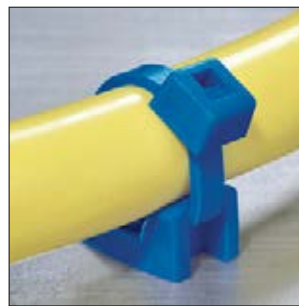
Fixing Tie Mount KR6G5-E/TFE.