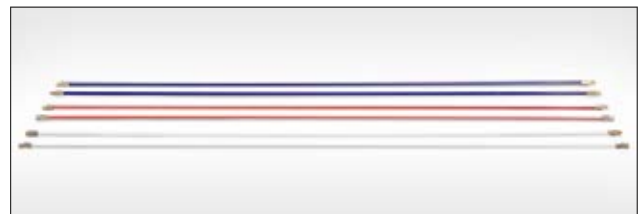
Overview of the rods selection.