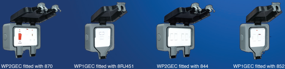
WP2GEC fitted with 870