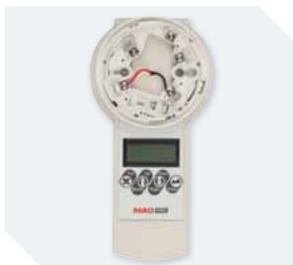
MAGPRO-PROG PROGRAMMING TOOL

For reading/writing addresses to Callpoints, detectors, sounders and modules.