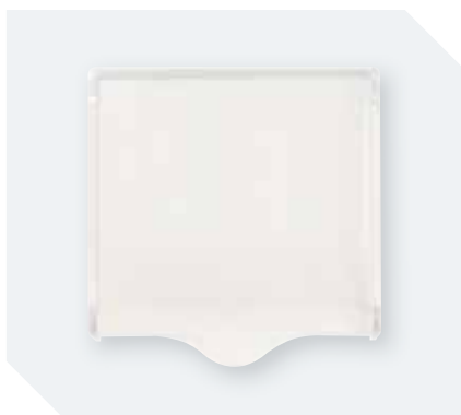
MAGPRO-CPC Plastic Cover for MAGPRO-CP (Pack of 5)