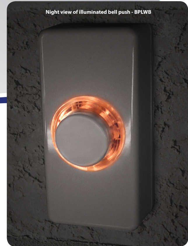
Night view of illuminated bell push - BPLWB