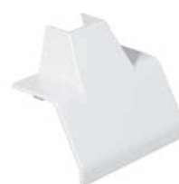
Angled mini trunking adapter