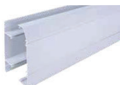
Challenger System 2 trunking assembly