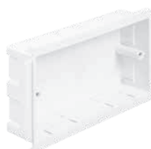
2 gang outlet box