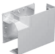
Flat angle - upward