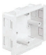
1 gang outlet box