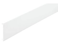
Main compartment cover