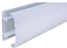
Challenger System 1 trunking assembly