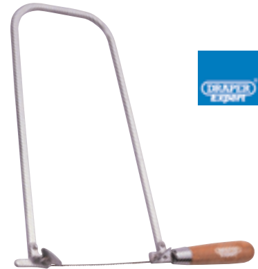
10 8905 FRETSAW

Expert Quality , plated frame with wooden handle and Supplied with 18tpi blade. Throat depth 295mm. Display packed.