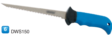
6 DWS150 150mm SOFT GRIP HANDPOINT PLASTERBOARD SAW

Designed for cutting plasterboard, chipboard or hardboard. Double bevel hardened teeth and soft grip handle for user comfort. Display packed.