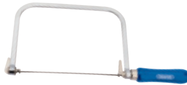
9 8904 COPING SAW WITH SPARE BLADES

Chrome plated frame with wooden handle and Supplied with five assorted blades. Blade can be turned through 360° for intricate work. Display packed.