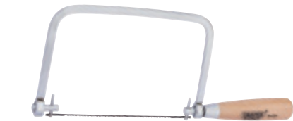
8 8901 COPING SAW

Expert Quality , chrome plated frame with wooden tensioning handle. Blade can be turned through 360° for intricate work. Display packed.