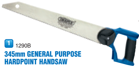
1 1290B 345mm GENERAL PURPOSE HANDPOINT HANDSAW

Multi-positional straight back saw, with hardened and tempered steel blade with precision sharpened teeth. The solid six-position soft grip handle is designed for maximum comfort. Display packed.