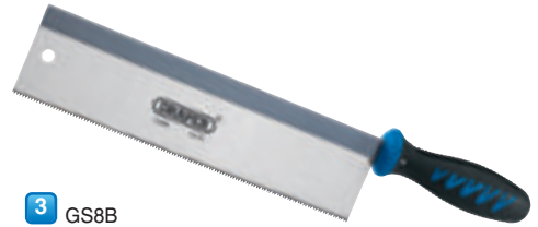
3 GS8B 250mm HARDPOINT DOVETAIL SAW

Ultra thin polished 10 TPI blade enhances cutting performance and the reinforced back provides extra rigidity. The soft grip handle improves user comfort. Display packed.