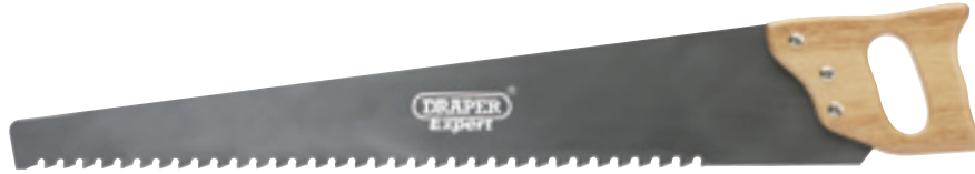
4 MS750 750mm MASONRY SAW

33 tungsten carbide tipped teeth for cutting soft bricks, Thermalite block, etc. High carbon steel non stick coated blade. Hardwood handle is securely fixed to blade and is designed to enhance user comfort and control. Sold loose.