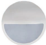
Eyelid cover Ideal anti-glare solution for Stairwells and other low wall mounted areas