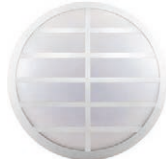
Grille Cover Decorative option