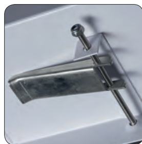
Easy Fix style bracket