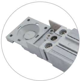
Generous Terminal Capacity