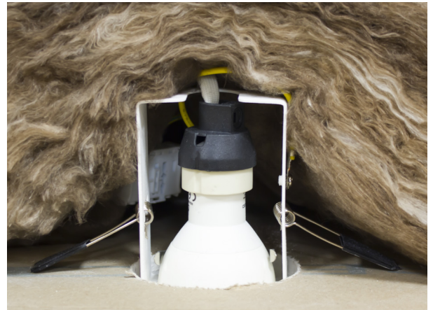
Models available with Insulation Guard so that loft insulation can be safely placed over the downlight.