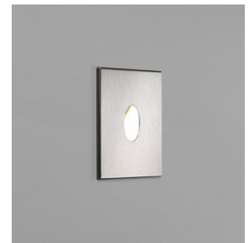
CODE: 1175002 FINISH: BRUSHED STAINLESS STEEL