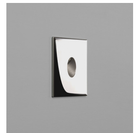
CODE: 1175005 FINISH: POLISHED STAINLESS STEEL

TO MAINTAIN THIS PRODUCT TO ITS BEST CONDITION, PLEASE VIEW OUR CARE AND CLEANING GUIDE ON THE SUPPORT SECTION OF THE ASTRO WEBSITE.